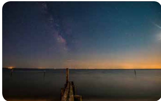
Photo Contest Winner first place winner; Heather Monks Artistic Category

MEMORIAL WEEKEND Friday, May 27 - Monday, May 30 LABOR DAY Monday, September 5 COLUMBUS DAY Monday, October 10