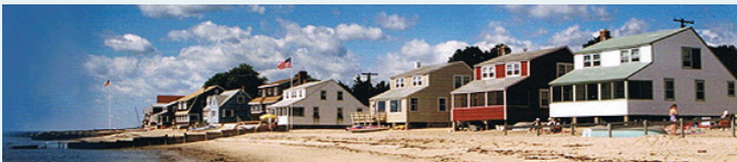
H.P. GARVIN III Hawks Nest Beach Old Lyme, CT 06371